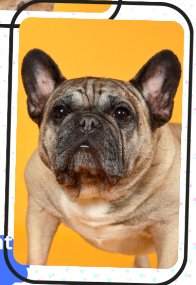
Vice President Marshall